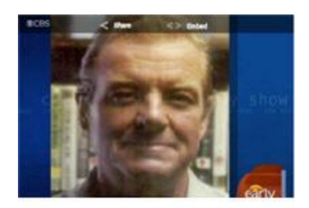
Click here to link to video

Holocaust Museum shooter part of an extensive, loosely-federated hate movement