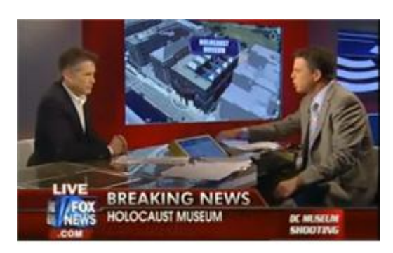
Click here to link to video

With the election of a black liberal as President, observers from the left and, surprisingly, a famous TV news anchor from the right have expressed concern that overheated conservative rhetoric has legitimized hate, energized the radical fringe and set the stage for even more mayhem.